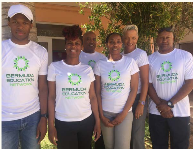
Northlands Teachers May 24th Relay Team