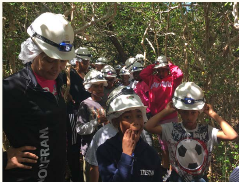
Horizons Hidden Gems Cave Exploration Expedition