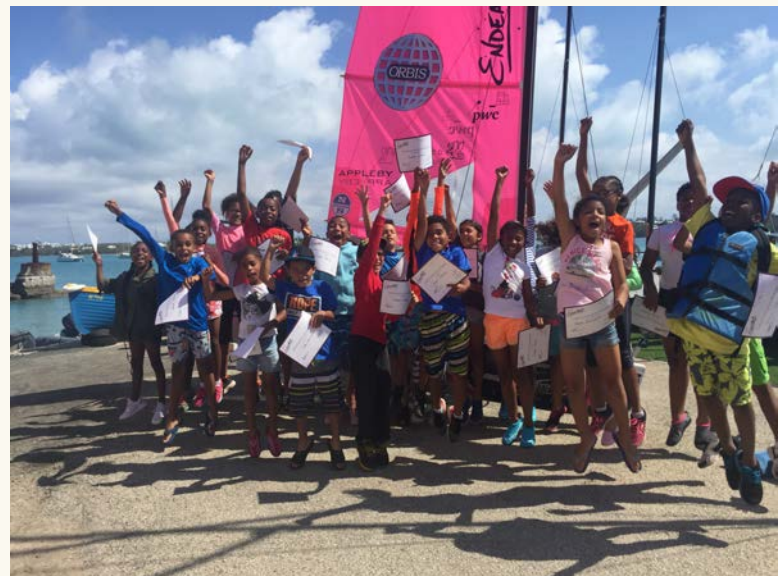
Horizons AC Endeavour Expedition