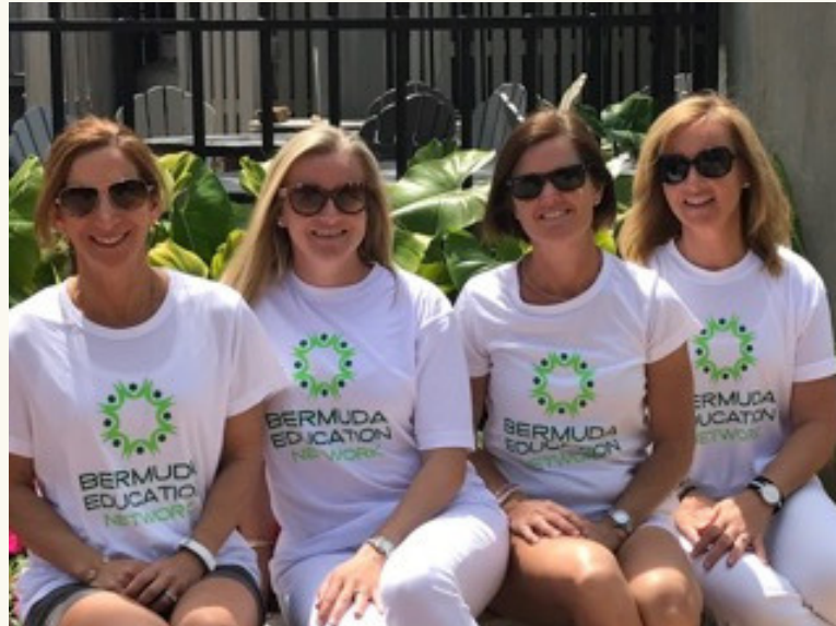
BEN Volunteer May 24th Relay Team