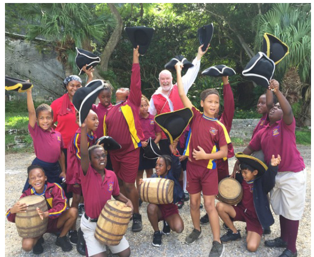
Northlands Primary - Gunpowder plot expedition, October 2018

"The class went on several field trips last year, but they came back to school raving that this was the best fieldtrip they have ever been on."